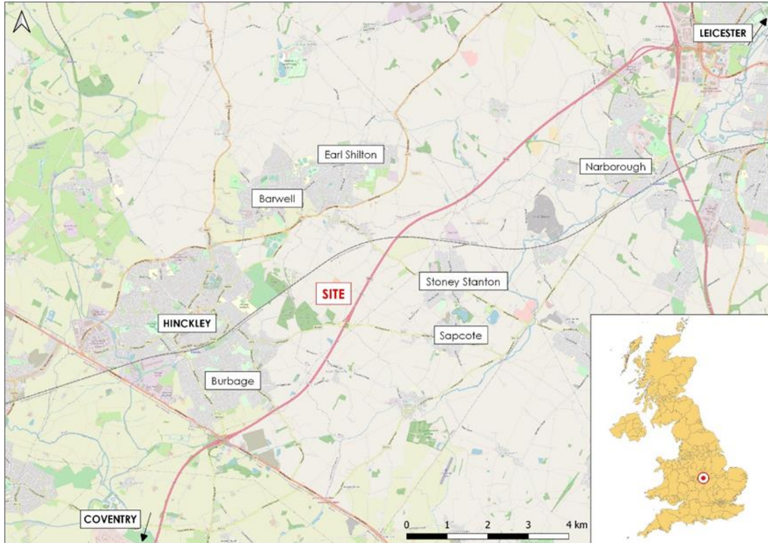
Figure 2: Urban Areas

Barwell and Earl Shilton to the north-east and Stoney Stanton and Sapcote to the east as shown in Figure 2.